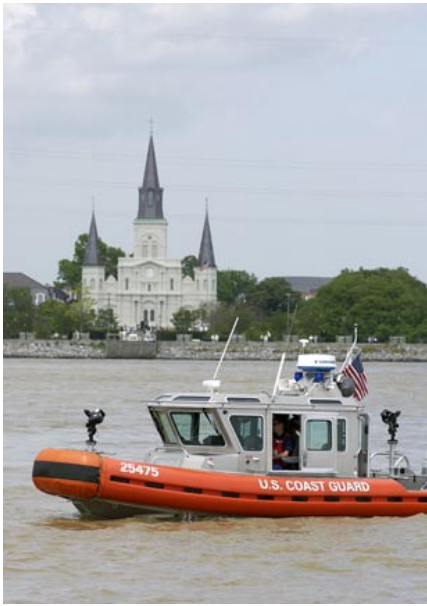
Left: A Coast Guard patrol boat crew, passes the St. Louis Cathedral.