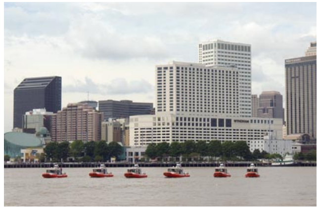
Coast Guard patrol boat crews, pass the New Orleans Riverwalk.

NEW ORLEANS (April 19, 2005)-Coast Guard patrol boat crews, engaged in boat tactics training in the Mississippi River. The crews, are assigned to Coast Guard Maritime Safety and Security Team 91112 in St. Louis. They are trained in advanced homeland security and maritime law enforcement tactics.